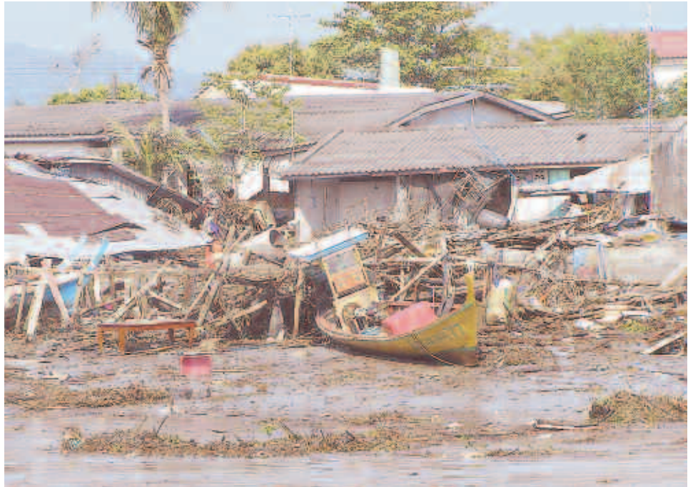
The divers returned to devastation.

Divers are helping in the clear up operation. Armed with large rubbish bags, they have been collecting debris off the Andaman Sea's coral reefs.