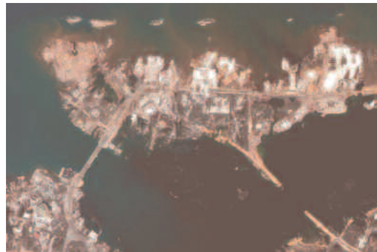
Banda Aceh shoreline as recorded on June 23, 2004 (top) and December 28, 2005 (bottom).