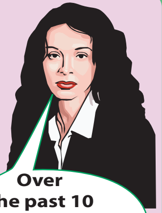
Science Research Council Spokesperson

People don't eat cows in India, but cows provide milk and also transport heavy loads. When cattle die their bodies are left for vultures to eat. Wild dogs grab any meat left over and microbes slowly break down the rest of carcass.